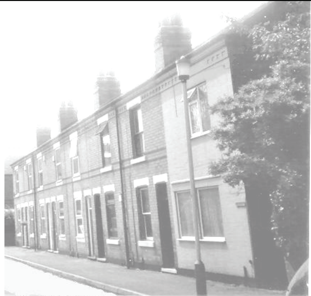
NEW HOUSES NOW OCCUPY OUR OLD HOME

We all now trust that this new splendid venue will serve us well for many years to come.