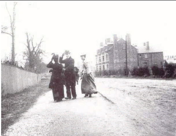
FINDING OUR WAY TO WILFORD LANE