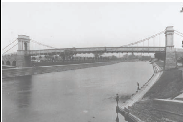
WEST BRIDGFORD SUSPENSION BRIDGE

At the time of going to print the impressive new Baptist Church situated on the corner of Musters and Melton roads will be ready for services early next year.